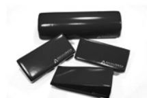
One Pair of Support Cushions donated by