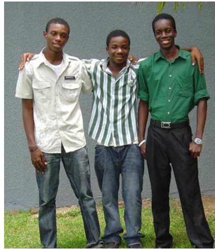
Three students are enrolled in the first sonography bachelors program on the continent of Africa at the Kwame Nkrumah University of Science and Technology. Several promising students were unable to attend due to limited funding.

educational settings. While home in the U.S., she worked with the American Registry of Diagnostic Medical Sonography (ARDMS) to arrange for registry exams to be given in Africa, which were eventually offered in Accra, the capital of Ghana. It was the first time ARDMS registry exams were administered outside of North America.