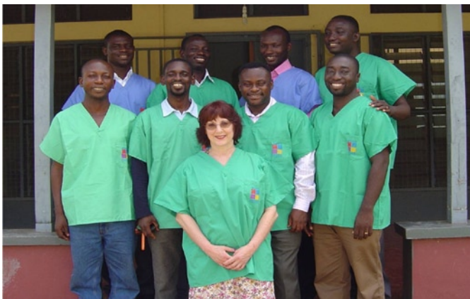
Aninwah Medical Center sonography program, August, 2000 – August, 2001. Three have since become registered. The other five are preparing for their ARDMS exams and need study materials.